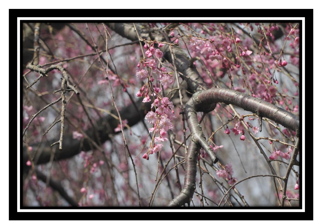
Vísít us at: <u>http://bath-ny.aauw.net</u>